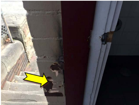
Photo 3. Exterior, throughout, walls – suspected lead-containing white lower paint system.