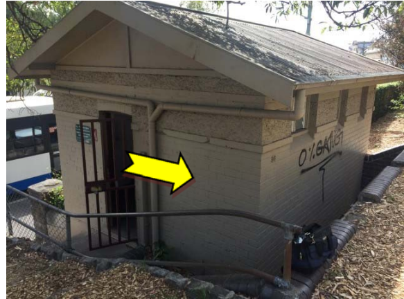
Photo 2. Exterior, throughout, walls – suspected lead-containing beige upper paint systems.