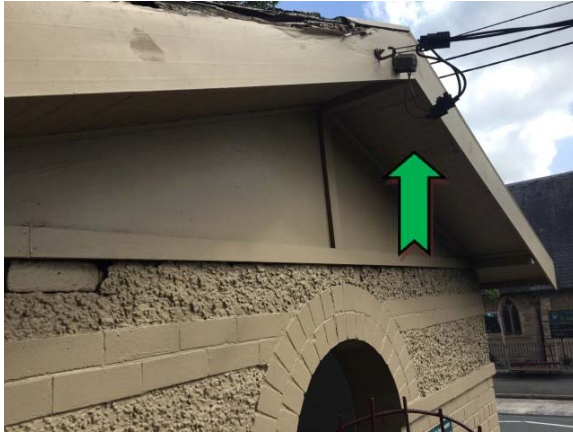
Photo 1. Exterior, east and west elevation, gable – non asbestos-containing fibre cement sheeting.