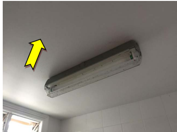
Photo 4. Interior, throughout ceiling – suspected lead-containing white upper paint system.